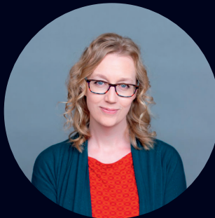
Kristin Kobes Du Mez is Professor of History at Calvin University